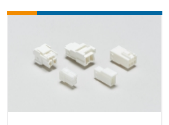
Rectangular Power Connectors(2)