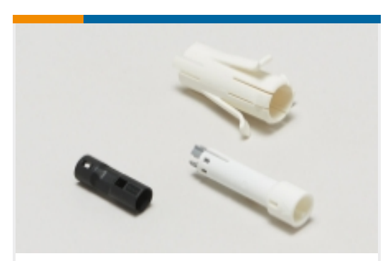
Plug & Socket Lighting Connector Accessories(1)