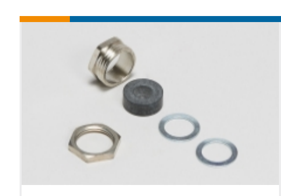
Circular Connector Hardware(1)