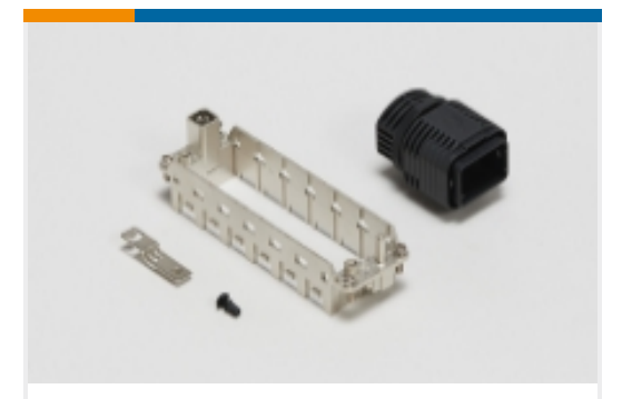
Rectangular Connector Hardware(13)